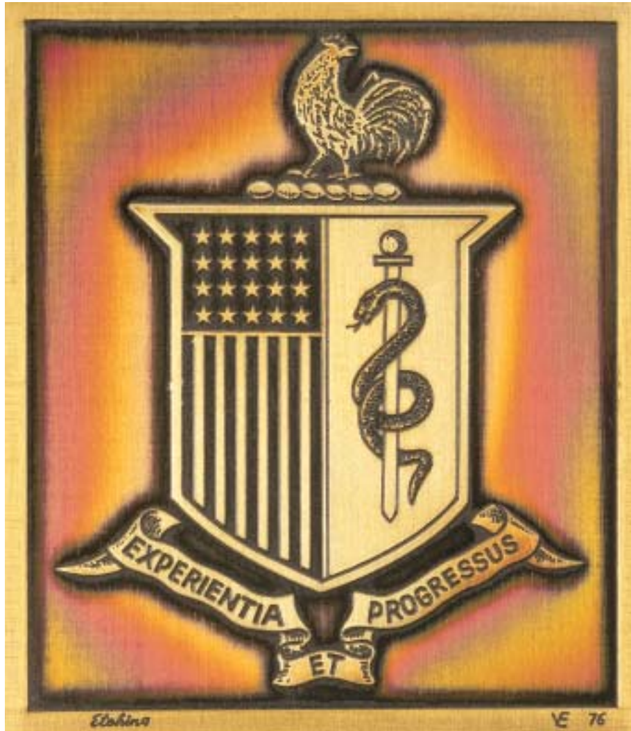
The Coat of Arms 1818 Medical Department of the Army

A 1976 etching by Vassil Ekimov of an original color print that appeared in The Military Surgeon , Vol XLI, No 2, 1917